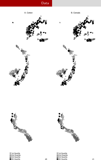
Figure: Cotton and cereals suitability indices of villages in the matched districts